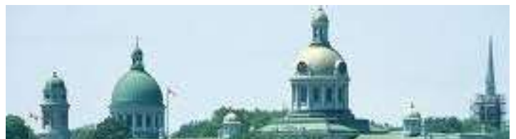
Kingston, City of Churches