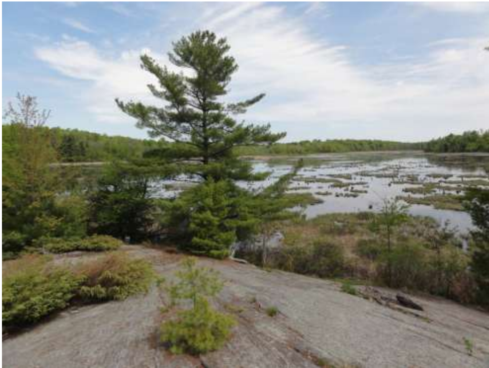
Sugarbush Island, Rideau Waterway Land Trust

The Canadian Land Trust Alliance reserve the right to substitute speakers and provide alternate events owing to unforeseen problems.