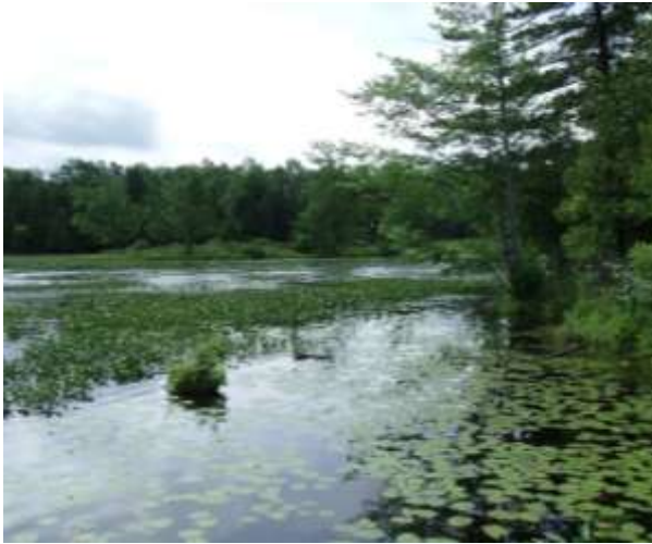
Frontenac Arch Biosphere