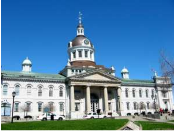
City Hall, Kingston, Ontario