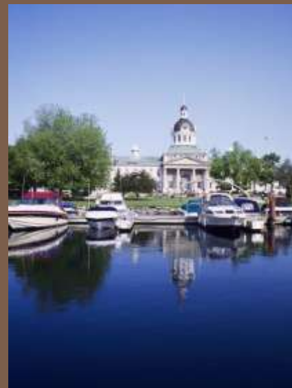
City Hall, Kingston, Ontario