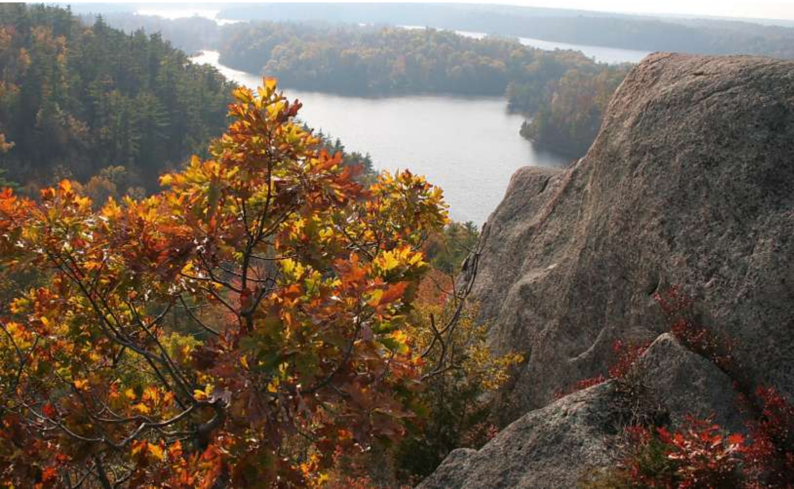
Rock Dunder in September