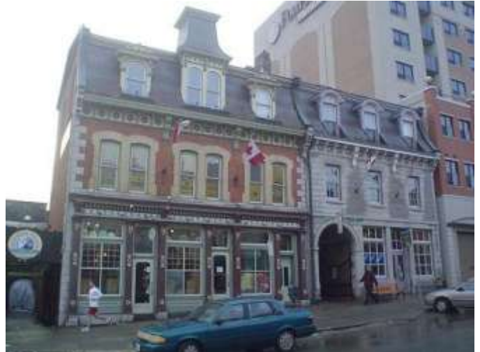
Kingston Brew Pub

of member needs and future programs. Land Trust staff will provide a unique outlook on how this program has assisted them in developing effective programs and policies. There will be an interactive case study component that will take participants through the implementation of some of the recommendations. This process will highlight the importance of adopting the S&P's while providing practical tools to support land trusts in implementing them back at the office.