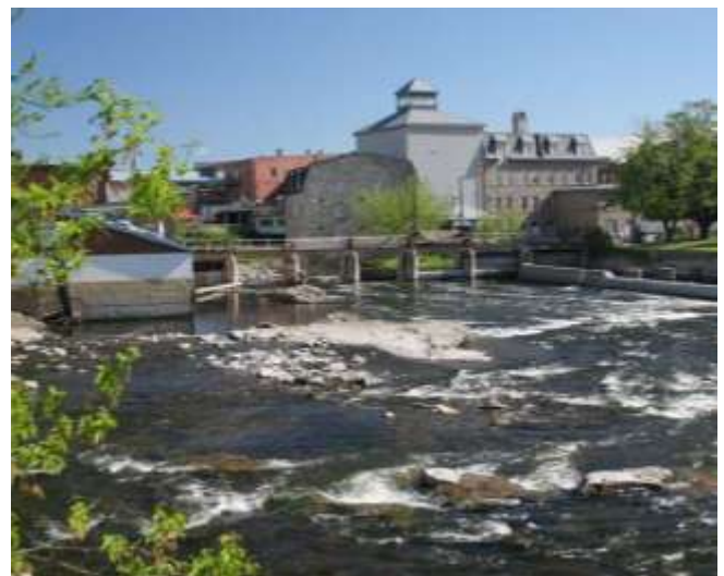
Parks Canada - Smiths Falls