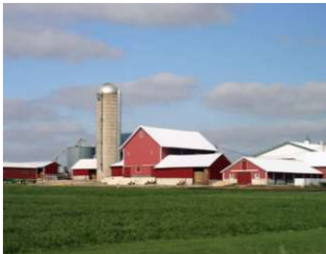
Agriculture - Eastern Ontario