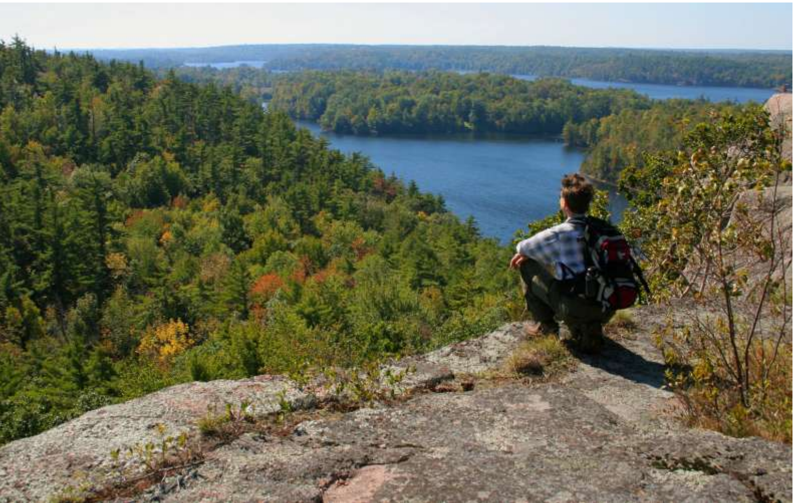
Rock Dunder - RWLT

IN PARTNERSHIP WITH THE ONTARIO LAND TRUST ALLIANCE